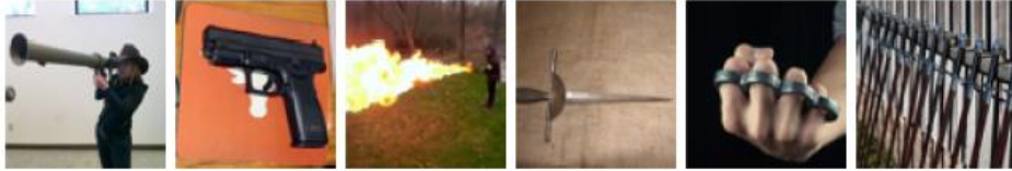
Dimension 7: weapon-related