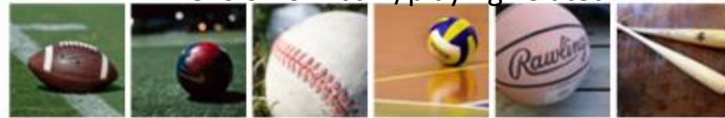
Dimension 62: game-/amusement-related