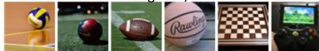
Dimension 63: childrens toy-related