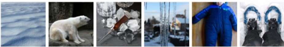
Dimension 54: coldness-related/winter-related