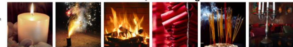
Dimension 33: fine-grained pattern