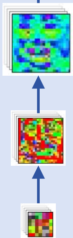
(b) Deep Features