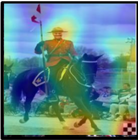
Clean Model Clean Data