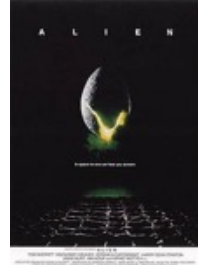
Thriller \times 3