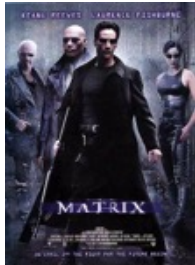
Sci-Fi \times 9