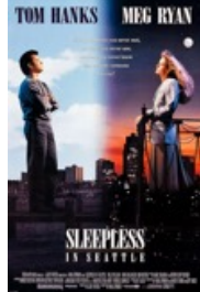
Romance \times 3