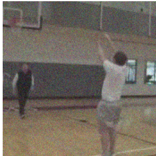
\sigma = 0.5 * \sigma_{ori}