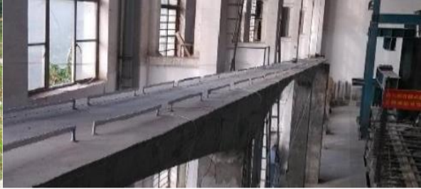
(b) scaled bridge model