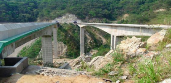
(a) Real bridge structure picture