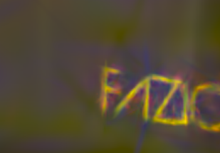
(a) BM3D 22.13/0.527/0.560