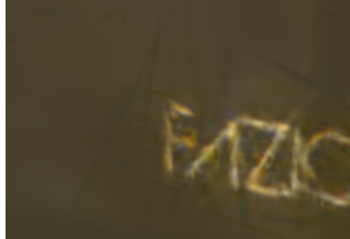
(b) ELD 21.73/0.544/ 0.521