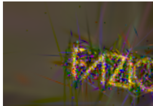
(h) HDR Scaffold-GS 20.18/0.457/0.605