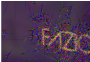
(g) LDR Scaffold-GS 17.20/0.366/0.701