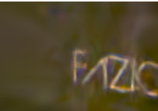
(f) RViDeNet 22.96/0.545/0.548