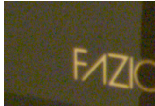
(j) Ground truth PSNR \uparrow / SSIM \uparrow / LPIPS \downarrow