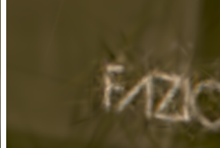
(e) Ne2Ne 22.96/0.547/0.535