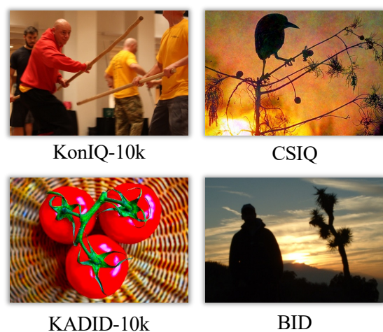
(a) Images with same rescaled MOS