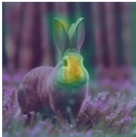
(c) + CR