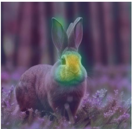
(g) Up block-1 (4x)