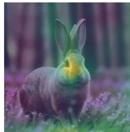
(e) Down block-1 (2x)