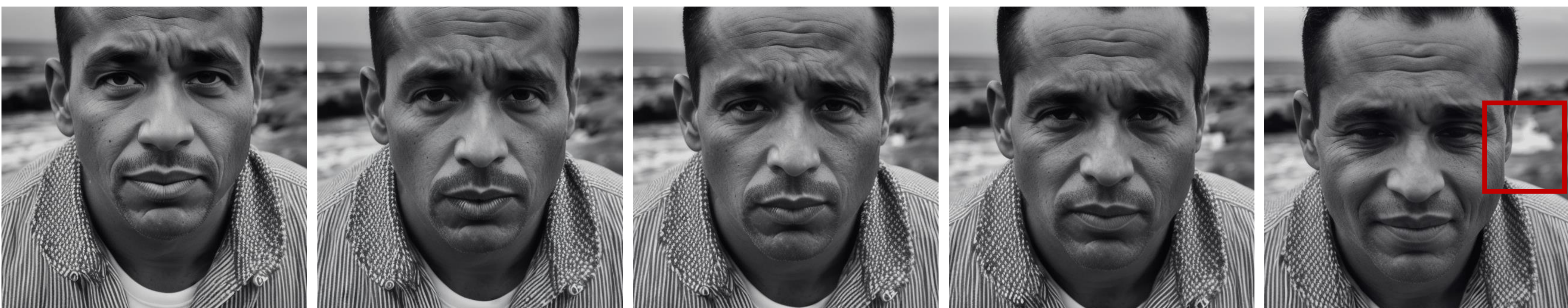
(c) + Shared K&V