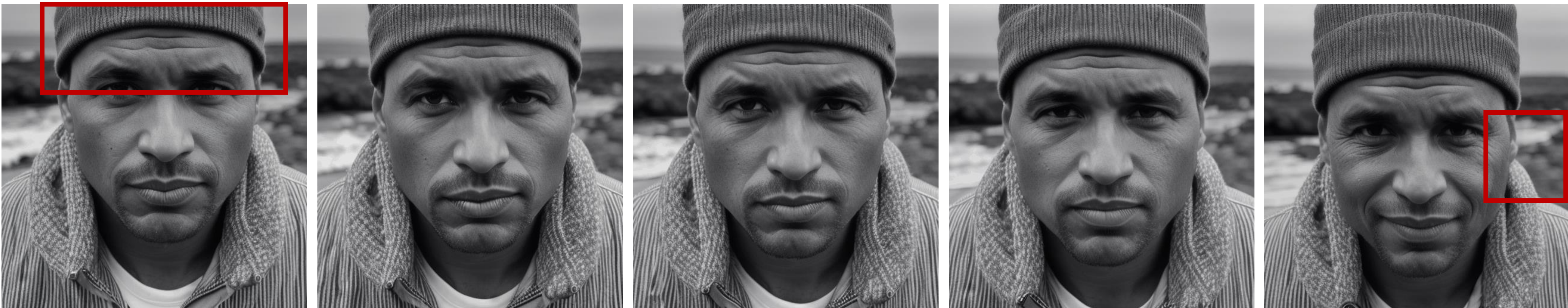
(b) Vanilla Motion Guide