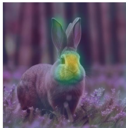
(d) + CR&MCF (MOFT)