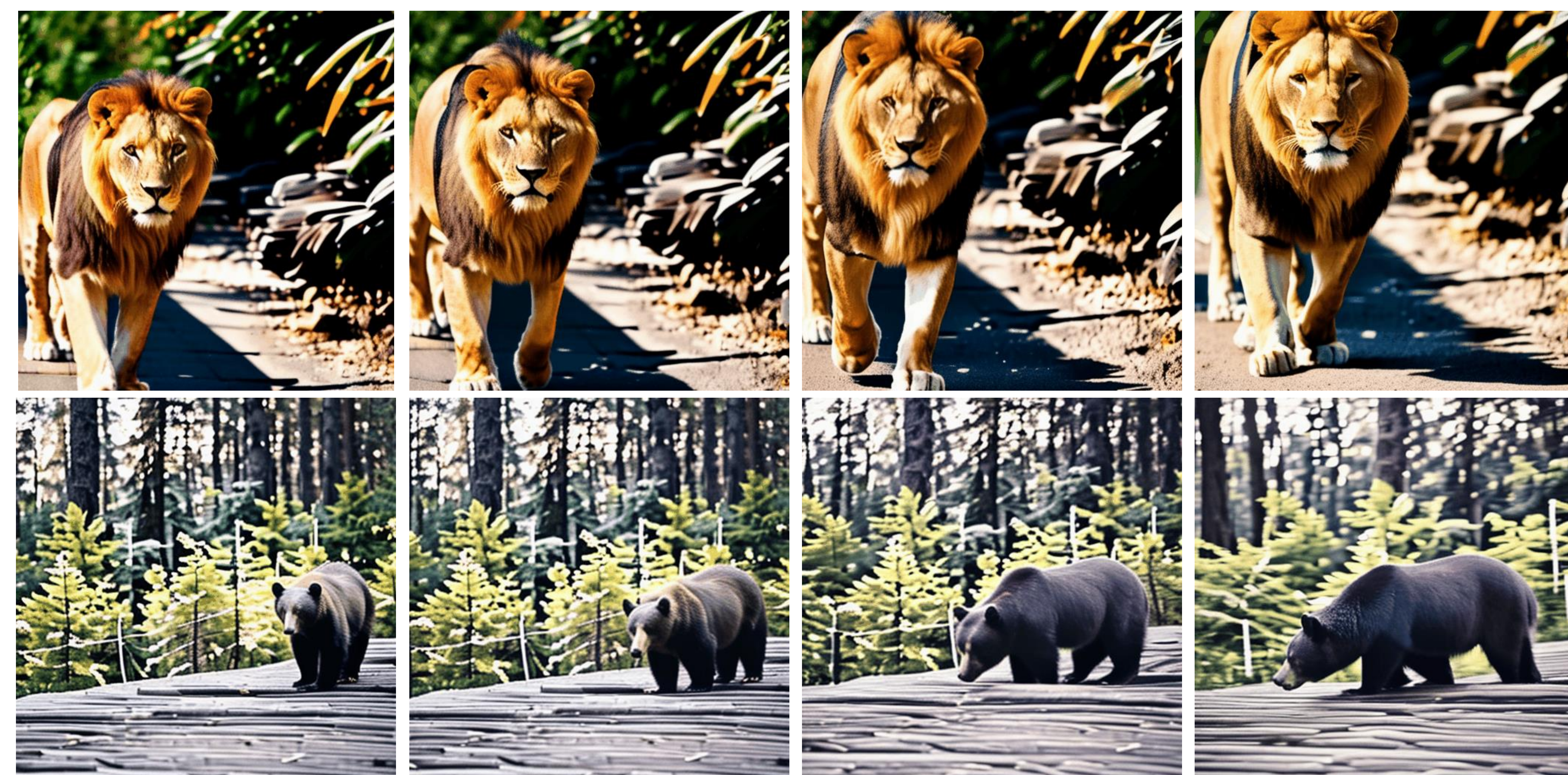
(c) Synthesized Control – Camera Motion