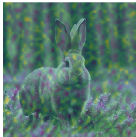
(h) Up block-3 (8x)