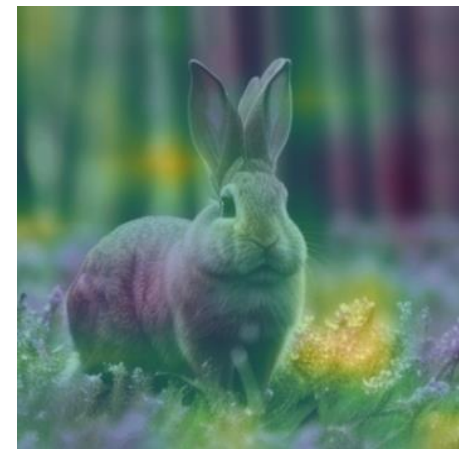
(f) Mid block (1x)