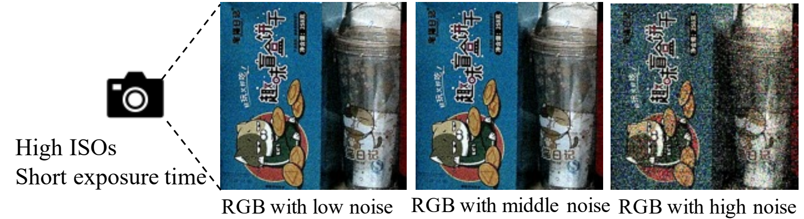
(a) Capture noisy RGB images.