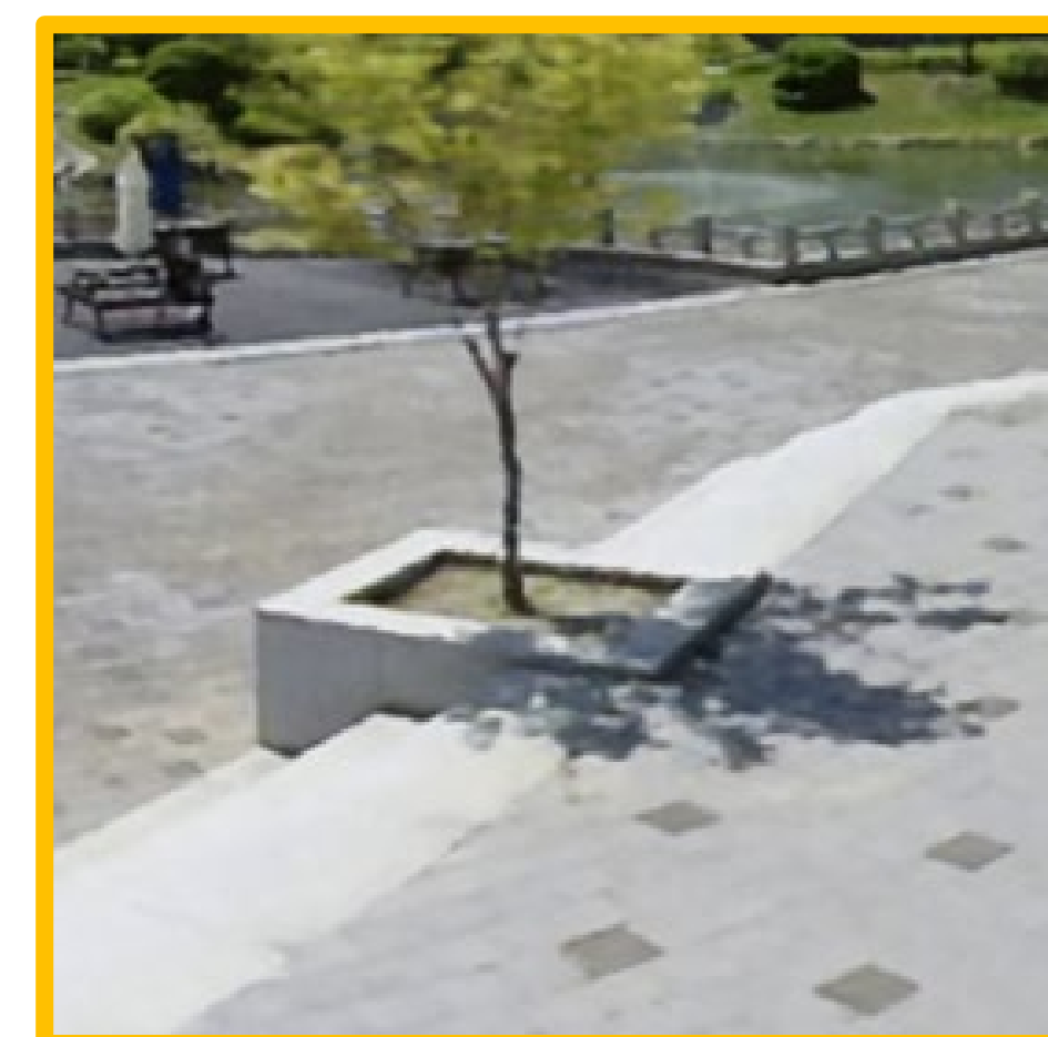
(b) OmniLocalRF (ours)