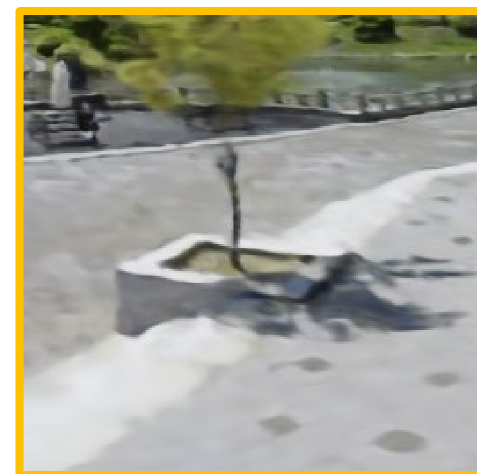
(a) Conventional neural rendering