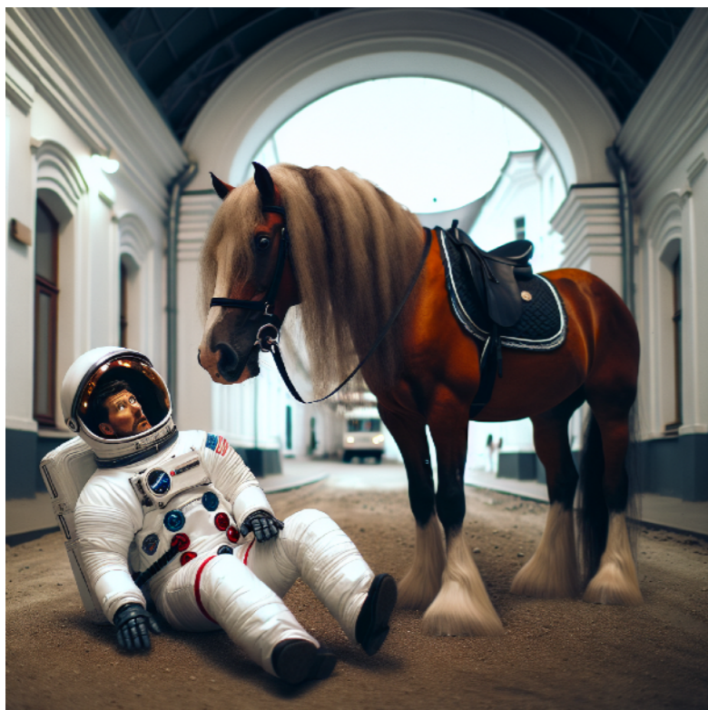
A horse riding an astronaut