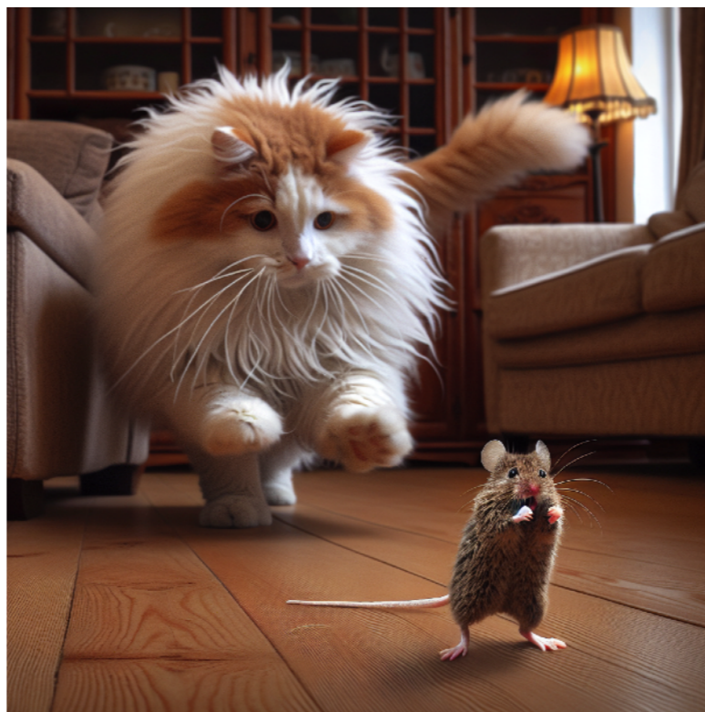
A mouse chasing a cat