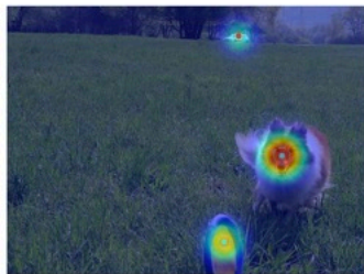
(e) C = 3