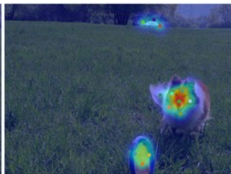
(h) C = 15