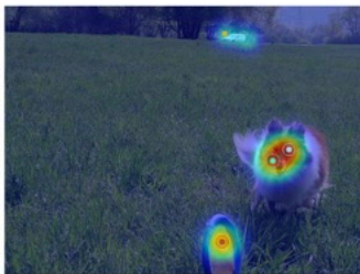
(f) C = 5