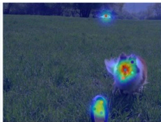
(g) C = 10