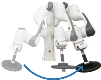
Payload Transport Problem