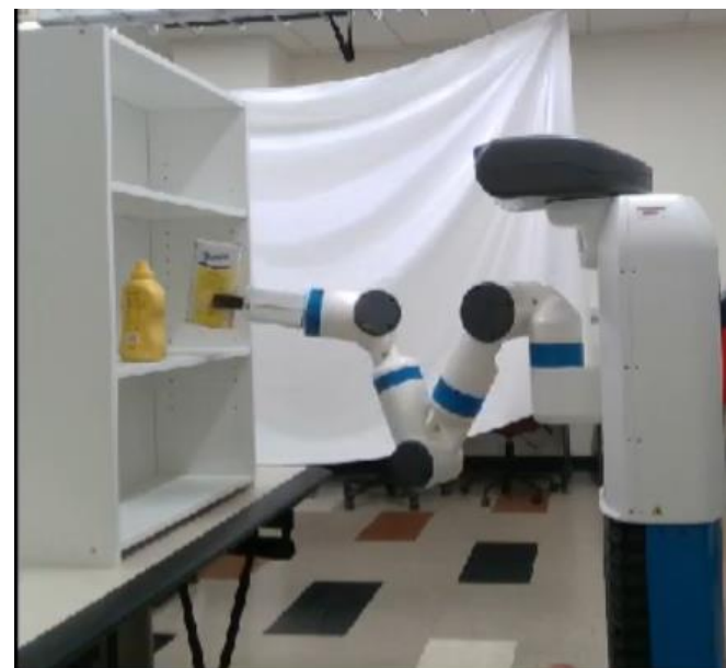
(e) Trajectory execution