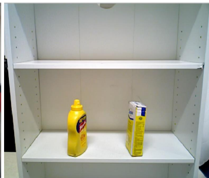
(b) Robot view