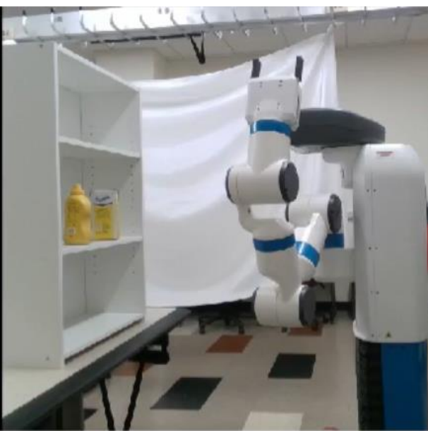
(a) A shelf grasping scene