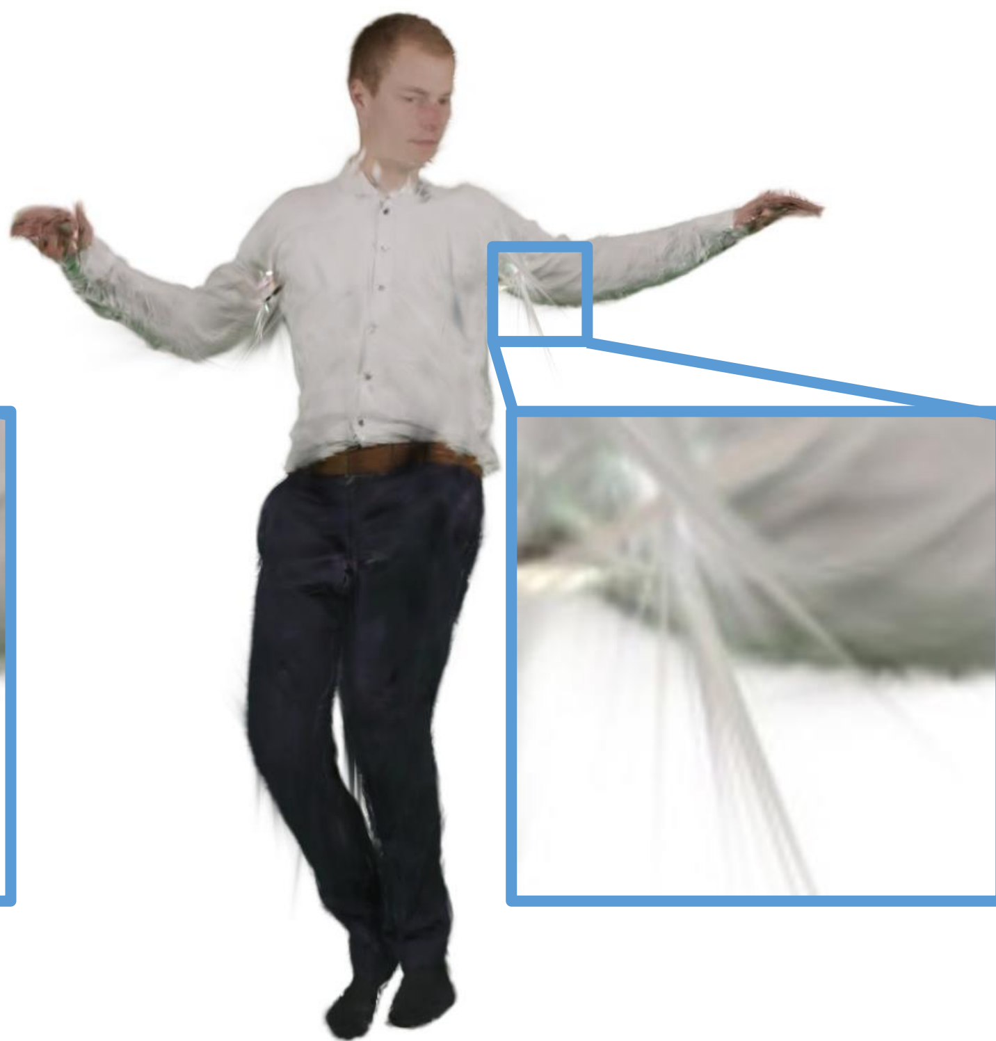
w/o scaling term