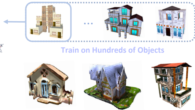
Train on Hundreds of Objects