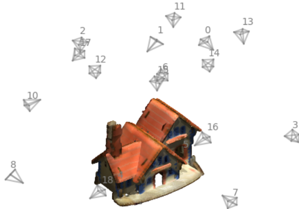
Ours with Scan-RL's Repre.