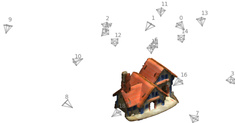
Ours with Scan-RL's Repre.