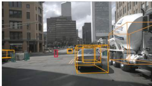
(b) 35 % Labelled Random