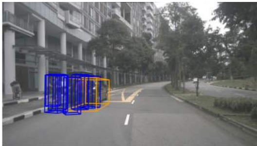
(b) 35 % Labelled Random