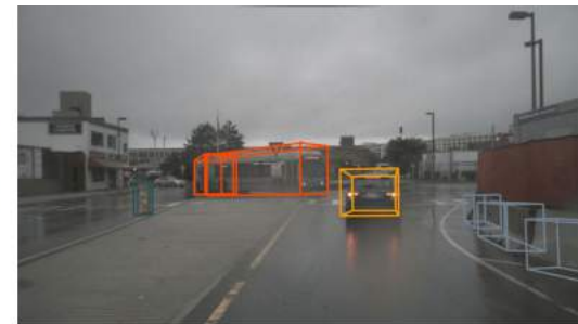
(d) Ground Truth