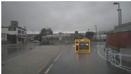
(a) 10 % Labelled Initial Split