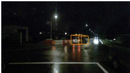
(a) 10 % Labelled Initial Split