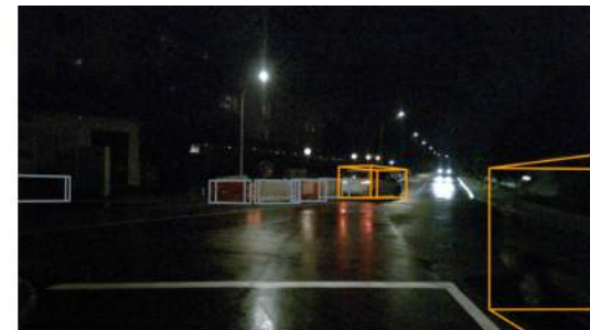
(d) Ground Truth