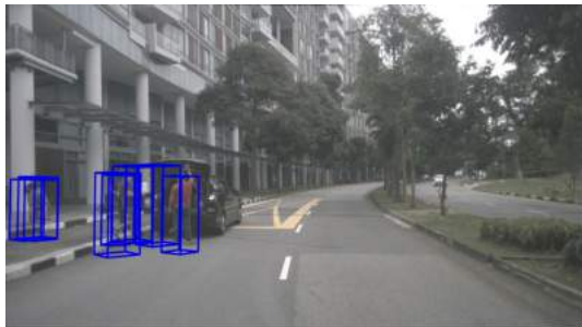
(a) 10 % Labelled Initial Split