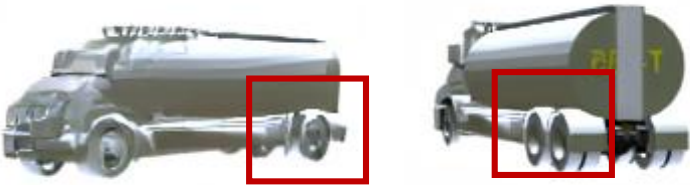
(a) Geometry Misalignment