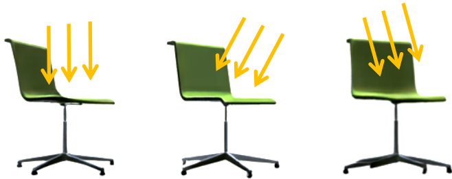
(b) Light Inconsistency