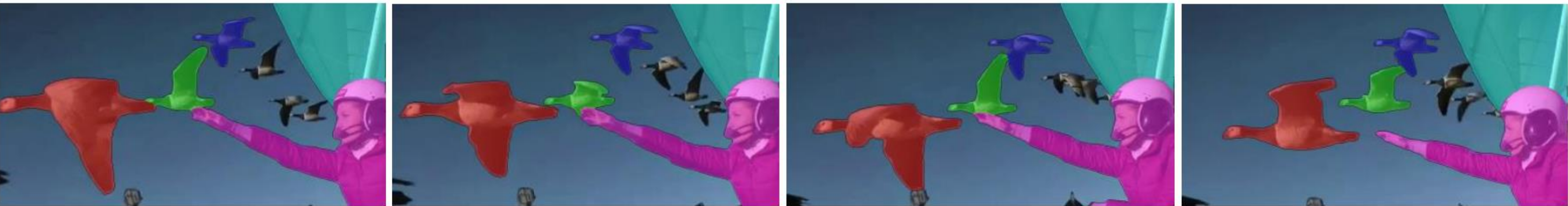
(c) Final result for the case in the wild