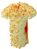
SHAPE AS POINTS