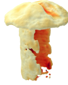
SHAPE AS POINTS