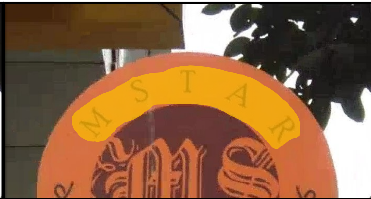
(b) With RC