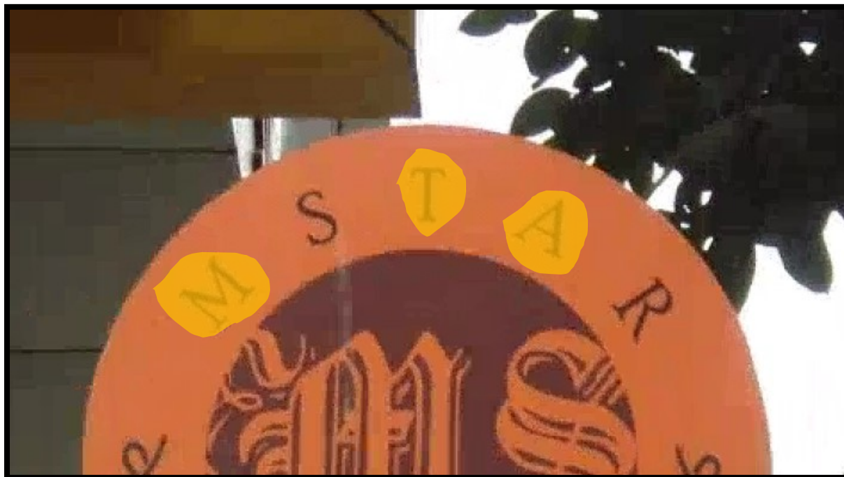
(a) Without RC