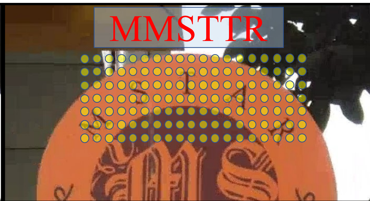
(d) Too much sampling points