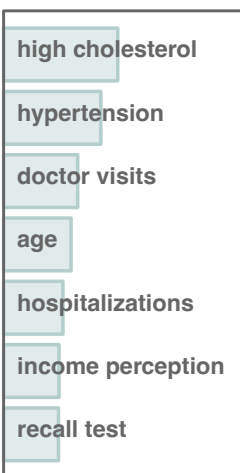
HIGH COLESTEROL HYPERTENSION