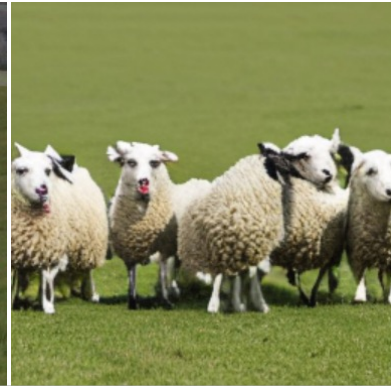
A herd of sheep chased by a border collie