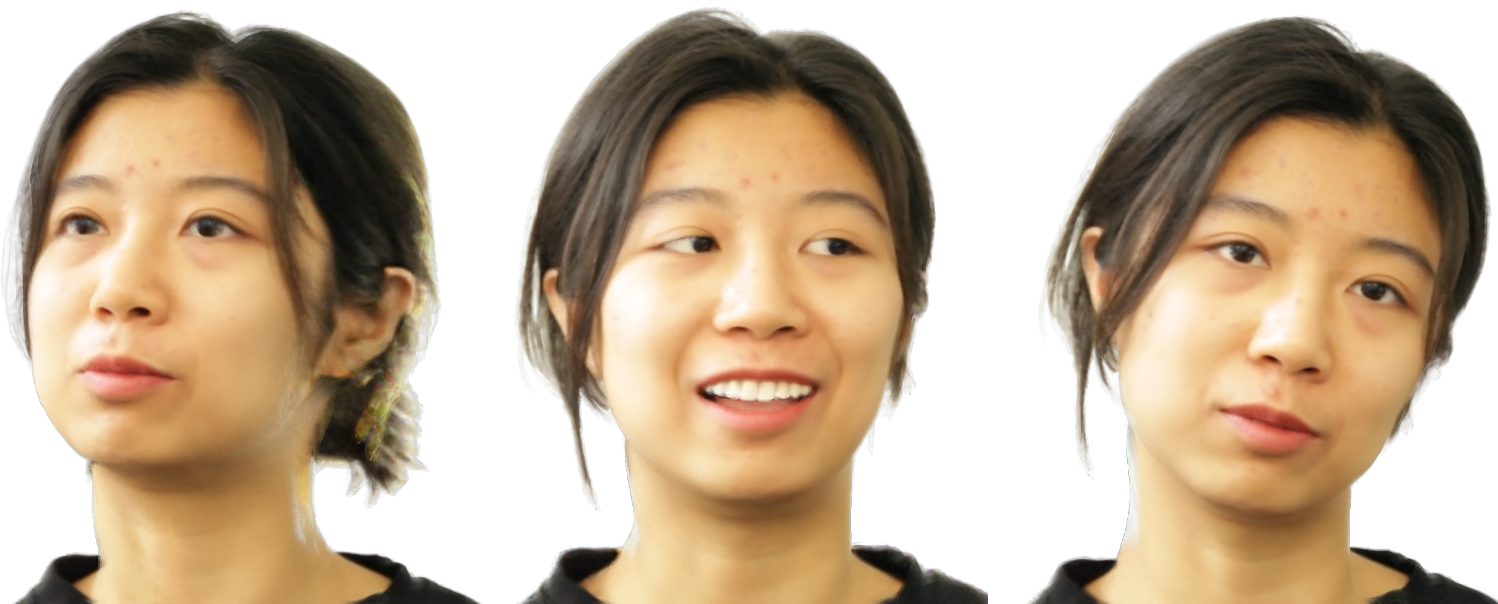
(c) View Synthesis, Expression Editing, and Pose Editing