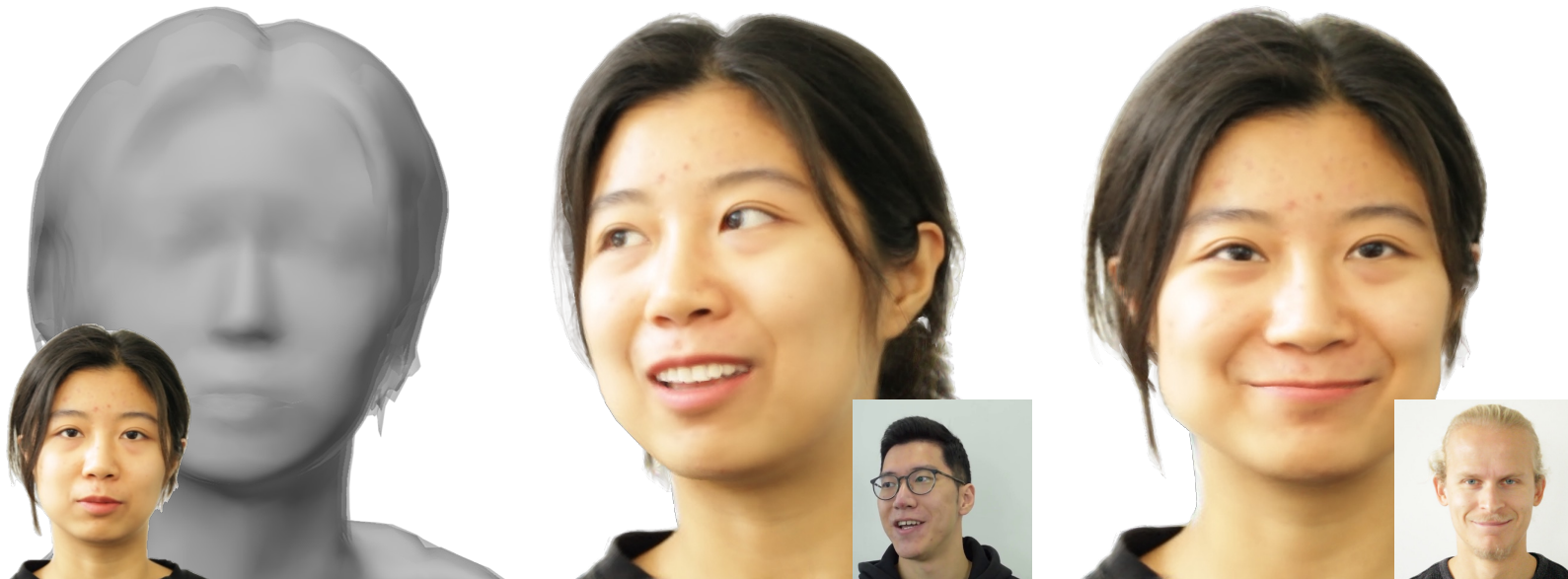
(a) Deformable Layered Meshes