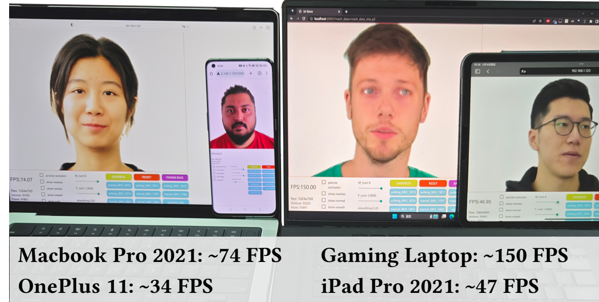
(d) Rendering speed on variety of common devices