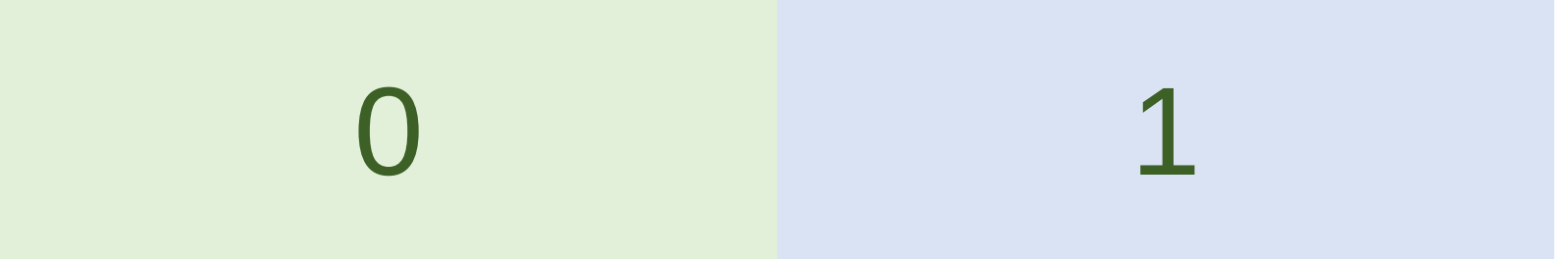
(a) Classical Bit