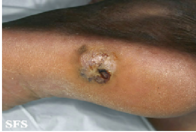
Skin Lesion Image