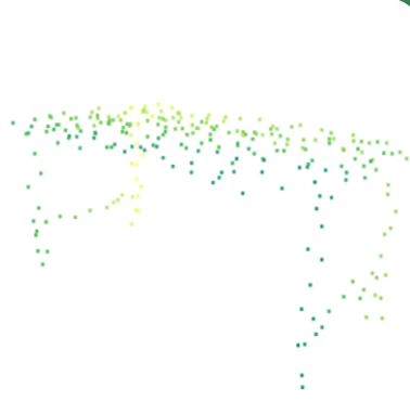
Farthest Point Sampled Input (25%)