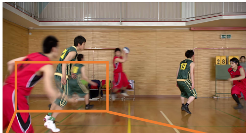
Interpolated Frame \bar{x}_t