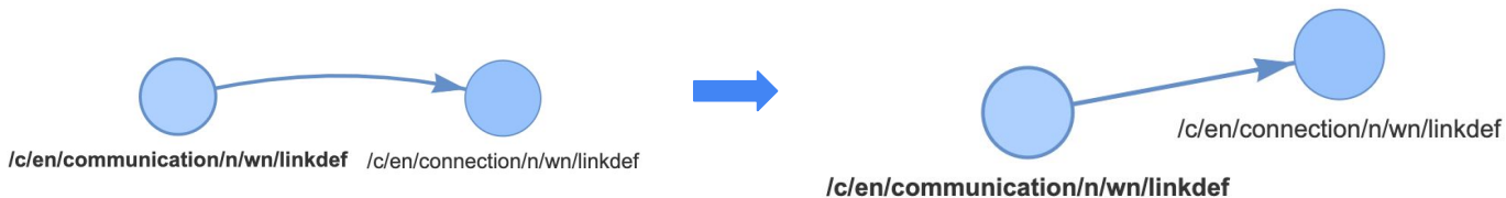
(a) 1-hop graph reconstruction