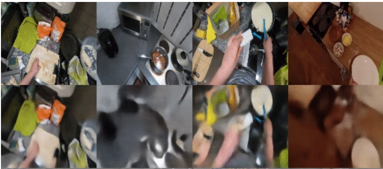
(a) World Model pre-training reconstructions