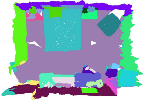
Pseudo Instance Label (Epoch 10)