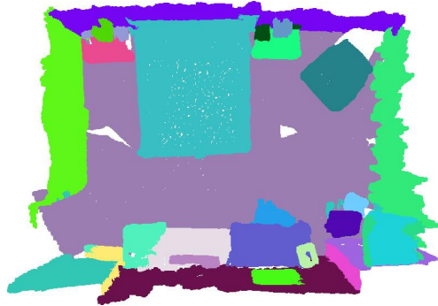
Pseudo Instance Label (Epoch 200)