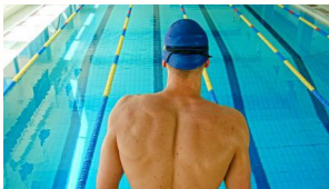
young swimmer in a swimming pool