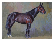
painting of a brown horse on a canvas, with a black tail and upright posture