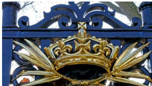
a golden crown on the fence