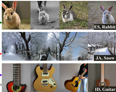
(a) High-coverage concepts