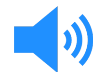
Crackle of a Fire