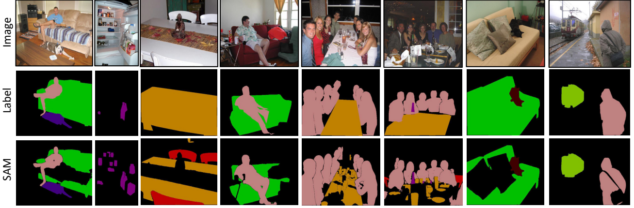
Figure 3. Examples of semantic obscurity. SAM-generated segmentation masks may have different semantic granularity compared to human annotations. For example, in the second column, human labellers only consider two containers as “bottles” while SAM labels many more items as “bottles”.

class labels in word(s) with full stops as the text prompt and generate grounded bounding boxes via Grounded-DINO [30]. Note that the text prompt is firstly tokenized into sub-words and grounding is then performed at the token level. Therefore, if a token (sub-word) is grounded in an image, we consider it as the grounding of its parent word. This approach enables us to map an arbitrary grounding back to one of the pre-defined class labels. For example, class “potted plant” is tokenized into four tokens: “pot”, “#ted”, “#pl” and “#ant”, where the special character “#” signifies that the corresponding token is an appending sub-word of the preceding token. The bounding box is assigned to the class “potted plant” whenever any of the four tokens is grounded. Once the grounded bounding boxes are generated, we feed them into SAM to produce instance masks. Finally, we join the instance segmentation masks into semantic segmentation pseudo-labels.