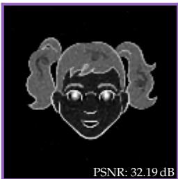
Sub-DIP L-BFGS max