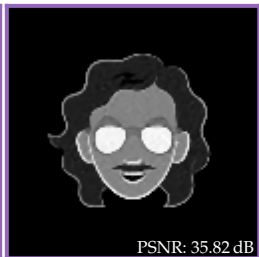
Sub-DIP L-BFGS last