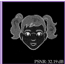
Sub-DIP L-BFGS last