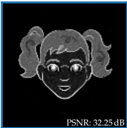
Sub-DIP NGD max