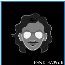
Sub-DIP NGD max