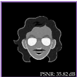
Sub-DIP L-BFGS max