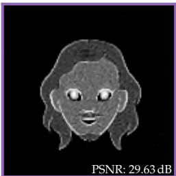
Sub-DIP L-BFGS max