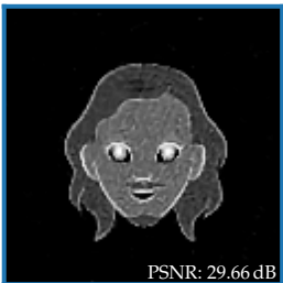
Sub-DIP NGD max