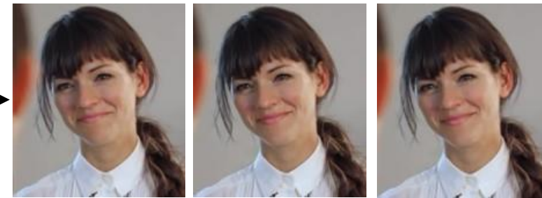
Person B (listener output)

“Knowing that you can do anything is absolutely inspiring to watch”