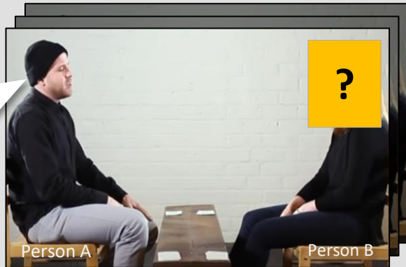
Video of Dyadic Conversation (One Person Masked)

"To be honest, I'm really scared. If you do move up to the Bay or I move away or something we may have to break up..."