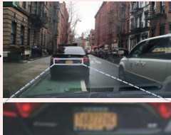
Aberrated Image I_A