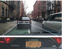
Scene Image I_S