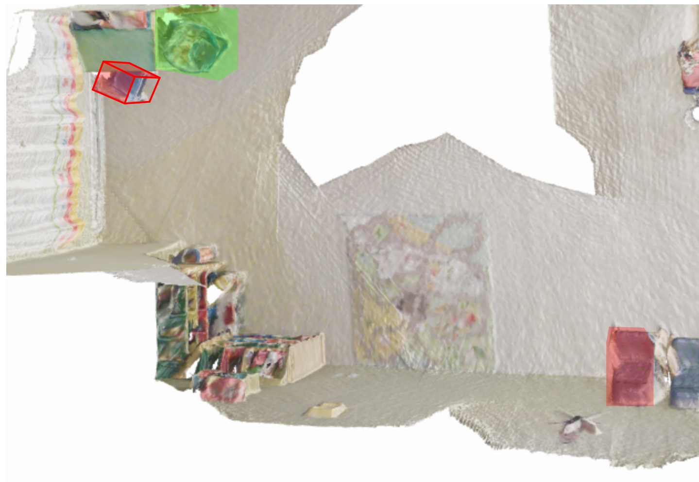
the blue circular chair