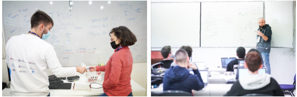
Fig 4. Participants and mentors interaction. Collaboration between students during the datathon event (left image) and a medical mentor explaining the meaning of some of the variables to one of the datathon team.

understanding of the pathologies and challenges faced in the clinic. Furthermore, this datathon event underscored the potential in exploiting the bright minds of university students from various faculties and backgrounds to design solutions that can impact clinical practice. It facilitated defining a road for data preparation and safe data sharing by the epidemiology and the IT units of the hospital. It helped understand how opening medical data to research can significantly impact patient management and beyond. Most importantly, the event seemed to be the vector necessary for establishing a dialogue between the Technion and its natural partnering hospital (Rambam) in the field of medical data science. Leveraging such a meeting between a technological university and its nearby hospital institution can serve as a model of trust building between partners. We will strengthen this bridge through the newly established CAIH.