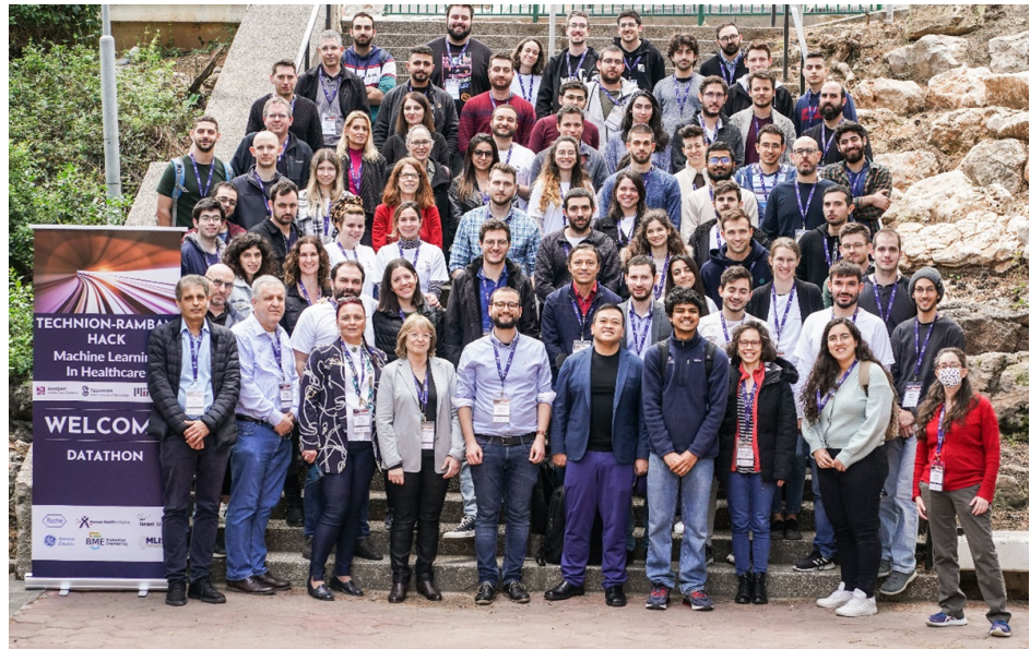
Fig 2. Datathon's participants and mentors. A total of 50 students and alumni participated in the event and were advised by 20 mentors.