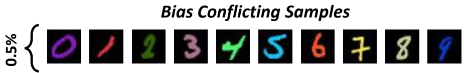
(a) Colored MNIST Dataset