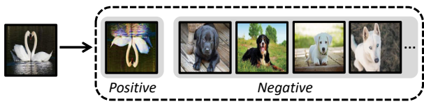
Stage 1: Self-supervised Learning