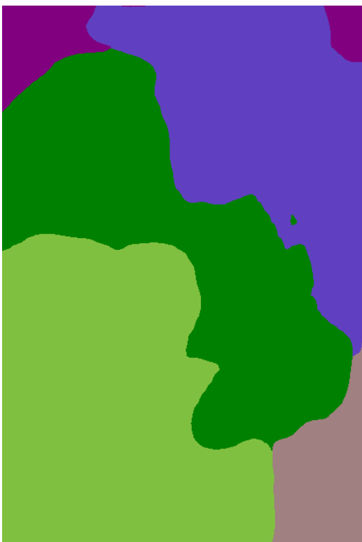
4 th cluster assignment