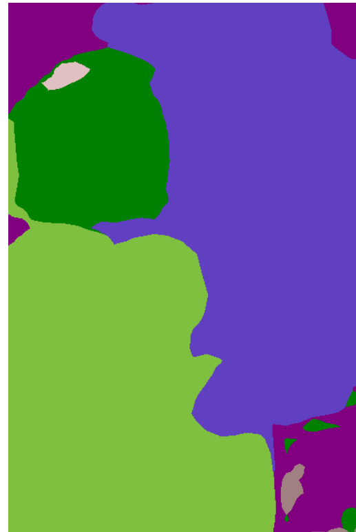
2 nd cluster assignment