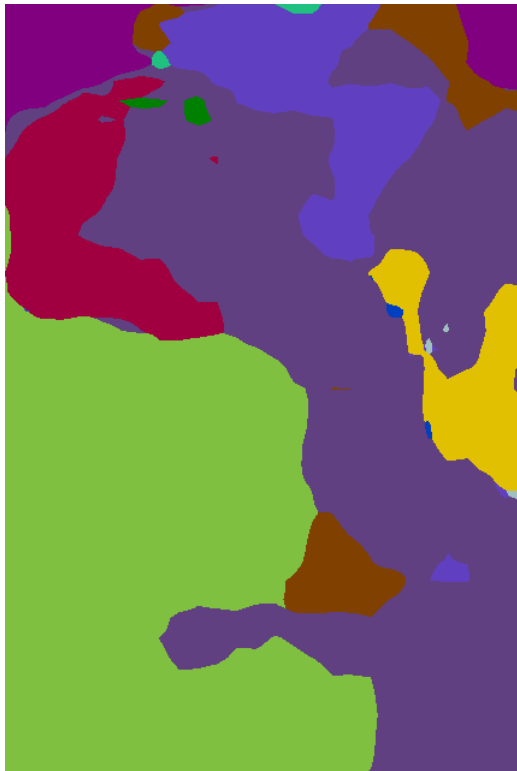
1 st cluster assignment