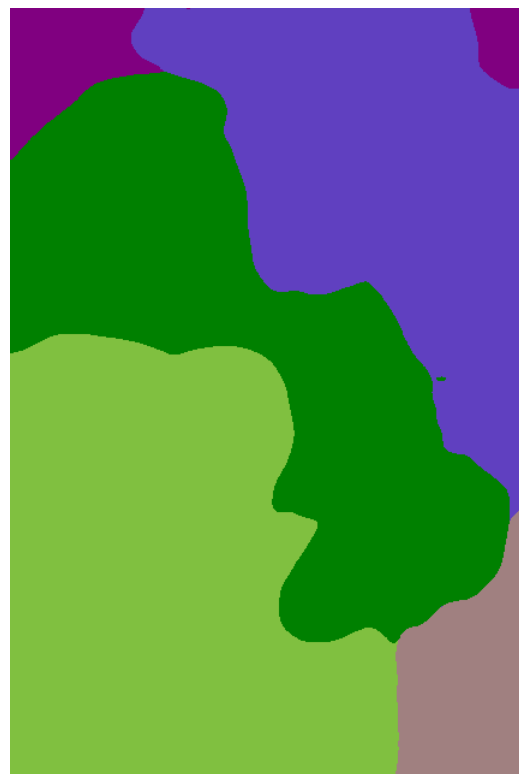
6 th cluster assignment