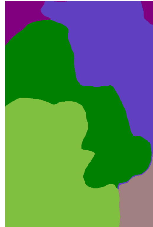
3 rd cluster assignment