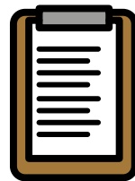
Benign Users / Transparency