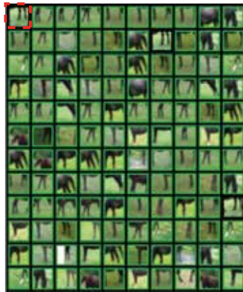
Projection - kNN