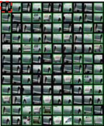
Projection - kNN