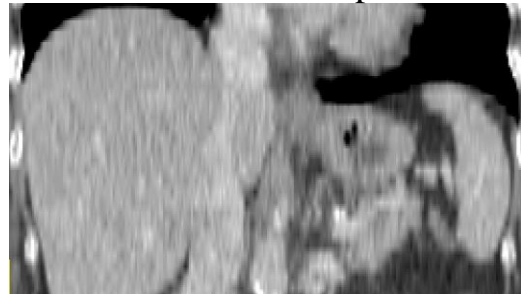
(c) Slice thickness: 1mm (resampled from 5 mm)