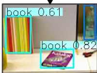
2-D Bounding Box