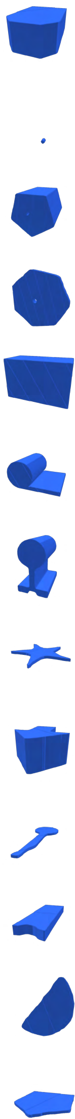
Our Extrusion Cylinders