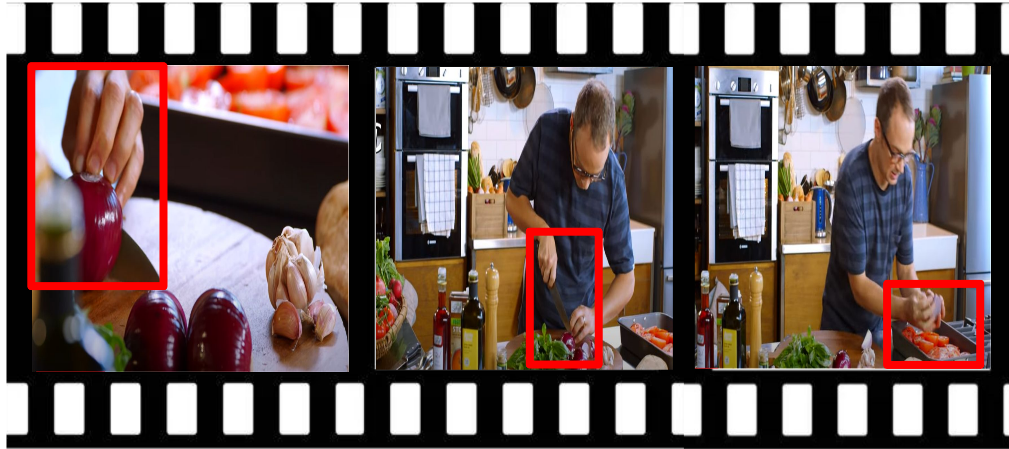
Narrated Interaction Localization (this paper)

“Cut the onions and add them to the tray.”