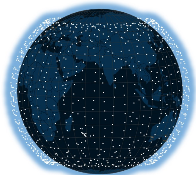
Figure 1: Starlink Satellite Map as of 21 st May 2021 [10]

Federal Communication Commission (FCC) of USA in 2018 has granted SpaceX Starlink permission to deploy a constellation of LEO satellites in five orbital shells. SpaceX Starlink has so far deployed more than 1500 satellites of the 1st shell at an orbit of 560 km and at 53.00 inclination [6,7,9-13]. Figure 1 shows the Starlink satellite map as of 21st May 2021 [10]. They are stationed on 72 orbital plains with approximately 20 satellites on each plain [13]. Satellites operate in Ku-band and each has a mass of approximately 240 kg [6]. The system uses phase array antennas for up and downlinks and laser communication in the inter-satellite link (ISL) [14,15]. Considering the fact that laser communication occurs in a vacuum, light travels 47% faster than in the terrestrial fiber network. A latency of less than 30 ms is expected in this network.